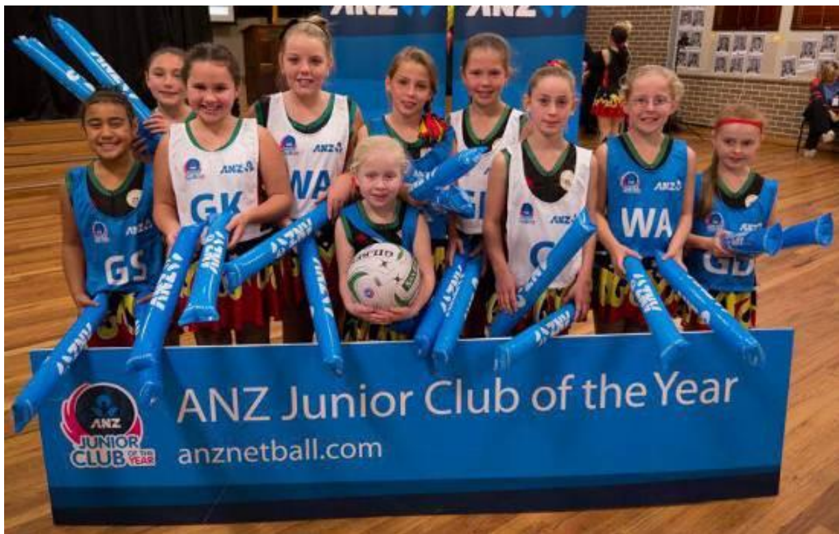
The 2013 ANZ Junior Club of the Year was the Central Coast team – Pelicans.

The Central Coast has proven itself to be a successful netball region comprising three associations, fifty clubs, almost 6,000 players plus volunteer umpires, coaches, managers and supporters.